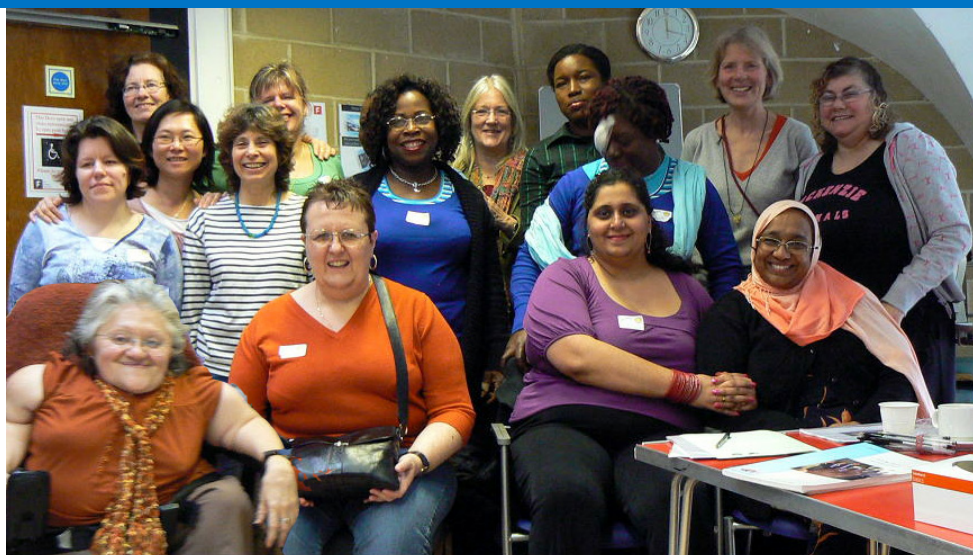
A Parents for Inclusion course, accredited by the Open College Network, funded by City Bridge

Gain nationally recognized Certification for what you do well and feel strongly about - become an agent of change